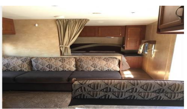
Figure 9. Ryshare.com, Inside amenities, 2018