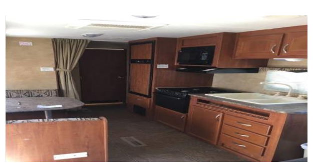
Figure 10. Rvshare.com, Dining hall, 2018