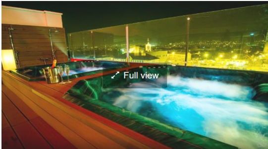
Figure 4. Tripadvisor, Riserva Wine Spa Oradea, 2018