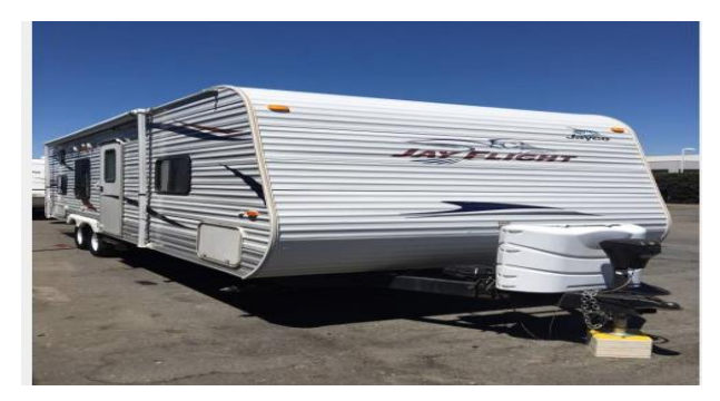
Figure 8. Rvshare.com, outside the travel trailer, 2018

In order to solve the limited infrastructure, Romania tourism market could introduce travel trailer /Recreational Vehicle (RV(Ranger, 2018)) tourism. A travel trailer vacation invites travelers to escape from the usual, well-trodden itineraries of mass tourism, and instead to discover the magic of undiscovered Romania: its borgoes, pristine nature, evocative landscapes and ancient traditions (Figure 8, 9, 10). For example: the VRshare company rents 7-9 sleeping capacity travel trailer weekly by 3800 Lei. The travel cost is more than half cheaper than the original Romania travel fee 8055Lei including the bus, train, plane tickets and accommodation. (The estimate original travel fee could be seen on Table 5 are designed for 9 travellers in 1 week trip, itinerary from Bucharest- Sinaia- Brasov-Sighisoara- Cluj-Constanta- Bucharest). The trailer amenities include CD Player, Fire Extinguisher, Refrigerator, Kitchen Sink, Toilet, TV, Shower, Roof Air Conditioning, Microwave, Bathroom Sink, DVD Player, AM/FM Radio and Hot & Cold Water Supply (RVshare, 2018). Travel trailer/RV tourism is suitable for family/group travelling, it could be a new tourism product for Romania.