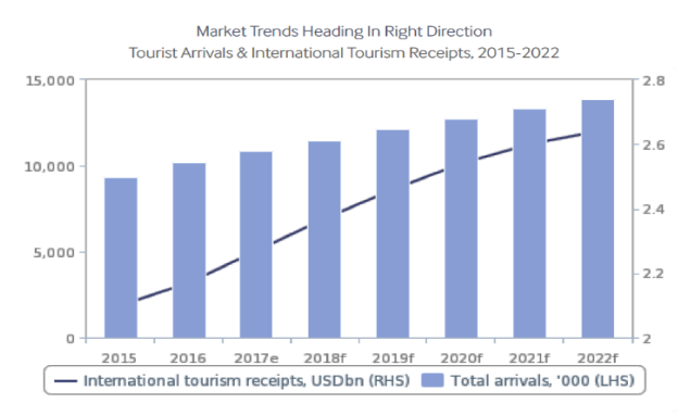
Figure 1. National source, Total arrivals expect and tourism receipts in Romania, 2018

Based on our current forecasts for the tourism sector, total international arrivals to Romania are expected to increase by 5.8% in 2018 to reach a total of 11.5mn . The forecast period has been extended to 2022 this quarter. International tourism arrivals are expected to increase by an annual average of 4.9% to reach a total of 13.9mn (Figure 1). This will provide a valuable boost to tourism-related spending and hotel industry value.