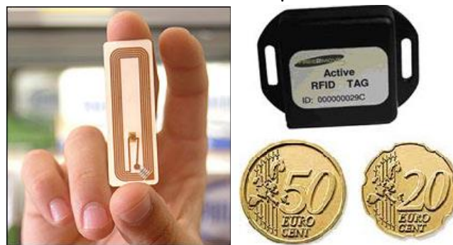
Figure 1 – RFID tags. Passive (left) and active (right)

RFID object location is a technology that allows the location and the identification of targets based on RFID tags. The targets are either objects or living beings, in our case, human beings. RFID identification represents an improvement of the UPC bar code system and is based on certain electronic devices named RFID tags. There are mainly two types of RFID tags: active and passive, see figure 1. Passive RFID tags can only be read by the RFID readers and, since they do not include power sources and the electronics is minimal, they are very cheap - under 15 USD cents each (RFID Journal). Usually, the passive RFID tags are not writeable and the amount of data that can be stored is under 128 Bytes. Because this type of RFID is not self-powered, it can only be read in the proximity of the RFID reader, where the energy harvested by the tag from the radiant electromagnetic field of the RFID reader is high enough to enable data transmission from the tag to the reader. Currently, in order to enable the reading of the RFID tag, the distance between the reader and the RFID tag must be under 3, 5 meters. Some types of passive RFID tags are writable (Want R., 2006), thus allowing users to add extra information and, thus, increase their flexibility and their range of applications. Among these, a subtype called WORM (Write Once Read More) includes RFID tags that can be written once and subsequently become "Read Only"