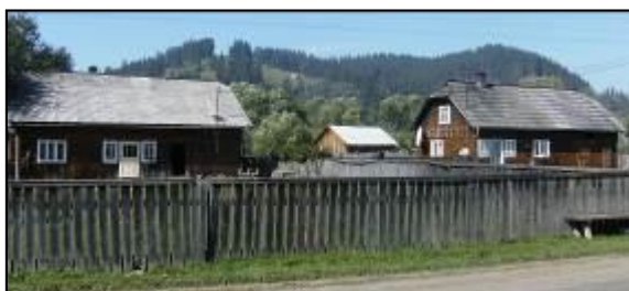
Figure 7 – „Freudenthal” houses, Moldovița village, photo: Otilia Vicol

The cultural landscape is not a static one, as the daily life is also part of it, as long as it still retains traditional customs and occupations. Fortunately, in Moldovița Valley the traditional occupations are still present although at a much smaller scale.