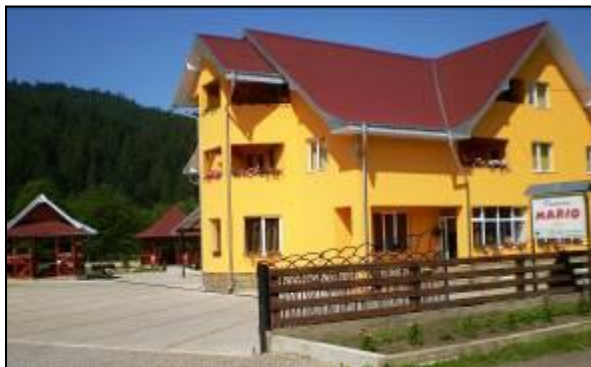
Figure 9 – Mario Pension, Frumosu village, photo: Otilia Vicol