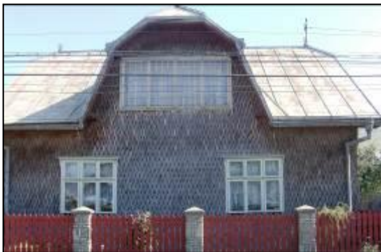
Figure 6 – House in Germanic architectural style, Moldovița village