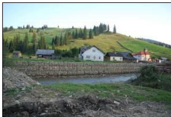
Figure 10 – Gabions on Moldovița river, Moldovița village

Necessary but distressing, the waste collection bins harm the serenity of the landscape, being placed in highly visible locations. The interventions regarding regularization of Moldovița river and of some tributaries by building gabions to protect the area from possible unwanted effects of flash floods also creates visual discrepancies (fig. no. 10). The only solution that can be proposed to improve these shortcomings would be tuning them - waste collection area could be fenced allocated a small wooden fence taking care every day to clean and sanitize the perimeter; river banks should be neat and rich in vegetation.