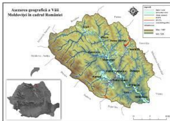
Figure 1 - Moldovița Valley geographical position within Romania

Situated in the north - north-eastern Romania, Moldoviței Valley is a subunit of Bucovina Mountains being framed on the west by Ferdeu Mountains and on the east by Obcina Mare Mountain (fig. no. 1). Along the valley, about 50 kilometers long, came into existence several localities, their evolution being closely connected with the history of the Moldovița monastery and the region of Bucovina.