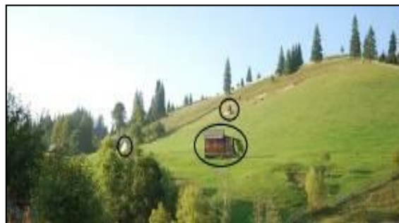
Figure 3 - Punctual elements (the haystacks and hay barn), Argel village