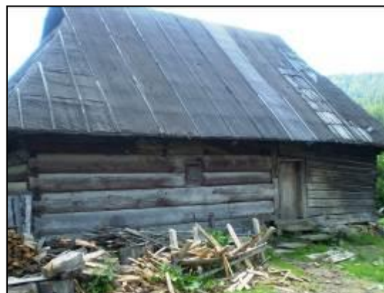
Figure 5 – Traditional Hutsuls house, Moldovița village, photo: Otilia Vicol

The local population presents certain characteristics and specificities as there are several ethnic groups in the area. Alongside Romanians there are the Hutsuls, the Germans and the Ukrainians, each putting their own mark on the landscape. Thus, alongside Romanian traditional houses one can also admire the traditional Hutzuls houses built of logs pine and yew joined with wooden pegs. Most of them could be found in Moldovița and Argel villages, the oldest in the area with over 300 years and being located in the village of Moldovița (fig. no. 5).