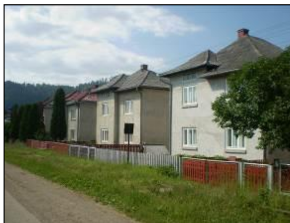
Figure 8 – Type of houses imposed during communism, Vatra Moldoviței village, photo: Otilia Vicol

However, the changes now occurring in the rural world are no longer dictated or imposed, but arise as a result of "borrowing" and "adoption" of foreign conceptions concerning the idea of progress and prosperity. The desire for modernization and the conversion toward tourist activities tend to make, unfortunately, in an ad-hoc manner, notwithstanding that ignoring the specificity of the place will inevitably lead to the destruction of the main tourism resources, the cultural landscape .