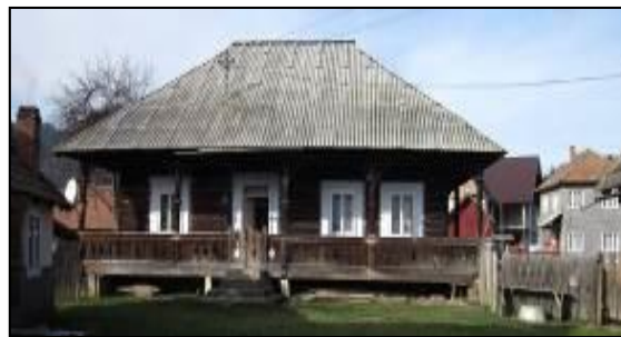
Figure 4 – Traditional Bucovina house, Strâmtura village, photo: Otilia Vicol

The traditional architecture is defined by harmony, an ideal accord between volume, material and technology. All these elements give the traditional village scale and character. It is a human-scale architecture of great sobriety, highlighted by a fine sense of proportion. These proportions come from a deeply understanding of the qualities and limitations of the building material (timber) and from respecting the inherited traditions that were influenced by regional conditions ( genius loci ) (RAO, 2009).