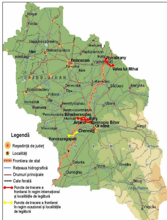
Figure 1 – Border crossing points in Bihor – Hajdú-Bihar Euroregion (according to Popovicu, 2007)

At the same border area - Romanian-Hungarian - the administrative unit Bihor - Hajdú-Bihar, there are 4 border crossing points with Hungary, the international crossing point regime (Fig. 1) and one occasional crossing regime (Fig. 1).